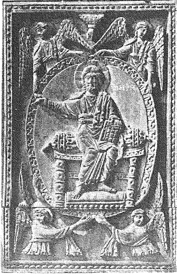
Jesus as Judge, 12th century carved ivory panel

a consoling positive reality; we do not have to die alone. The baptized Christian knows that his or her life belongs to Christ and that death is the physical completion of the “dying with Christ” that began at Baptism. Jesus opens up his own death to allow us to die with him; his obedience and love to God the Father can become our obedience: “For if while we were enemies we were reconciled to God by the death of his Son, much more, now that we are reconciled, shall we be saved by his life” (Rom 5:10).