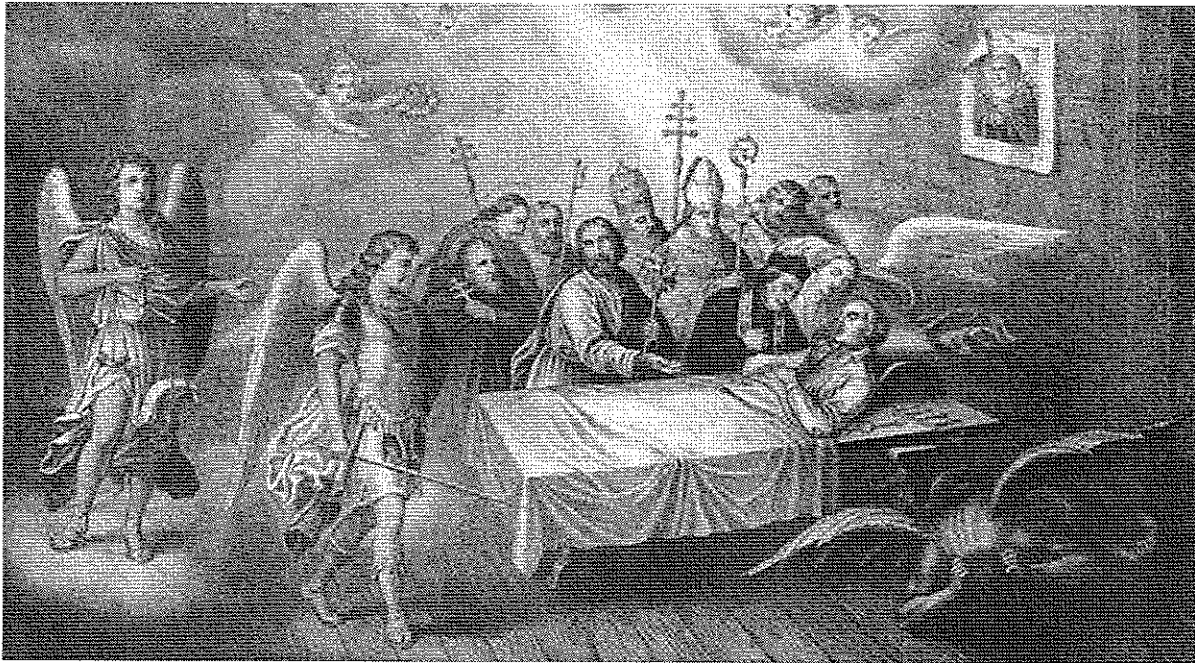
The Peaceful Death of the Just, 19th century lithograph

not force us to love him. He wants us to spend eternity with him — but the choice is ours. We have the chance to turn to Jesus while we are alive, but at the moment of death, our choice is frozen, suspended forever in time (see CCC 1021). We either die in friendship with the Lord or we die out of his grace, in persistent rejection of his love to the end. A person who dies in a state of mortal sin has made a tragic, yet free choice — and will spend eternity separated from God by his or her own choice.