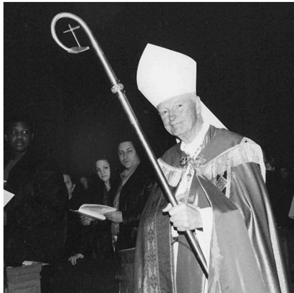
His Eminence Theodore Cardinal McCarrick, Archbishop of Washington, DC

“On this one day of the entire year, the Mass is not celebrated.”