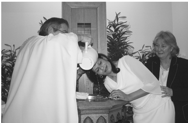
An adult Baptism during the Easter Vigil Mass on Holy Saturday

The theme of Easter morning continues the triumphant joy of the Easter Vigil. It remembers and celebrates the very foundation of Christianity: Jesus is raised from the dead, and is Lord. Those who believe and are