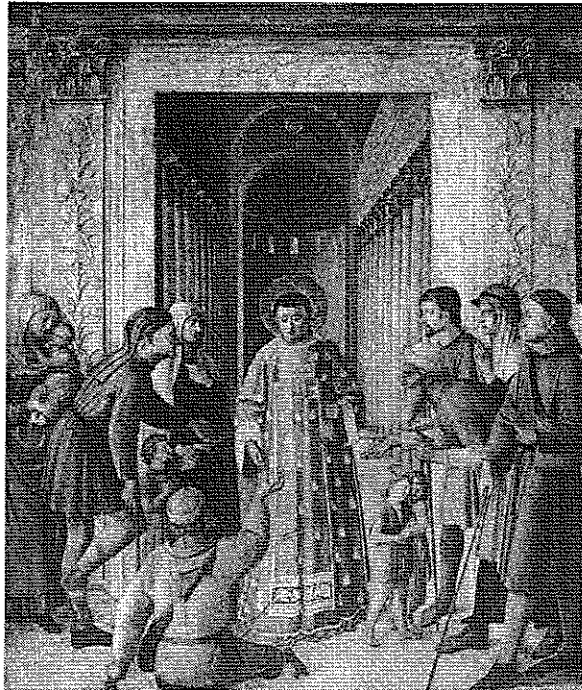
St. Lawrence distributing the treasures of the Church to the faithful, by Fra Angelico, 1387-1455

and fasting is also a time for spiritual battle. Turning to God in prayer and meditating on his Word in Scripture will sustain us through this time and prepare us for the great feast of Easter.