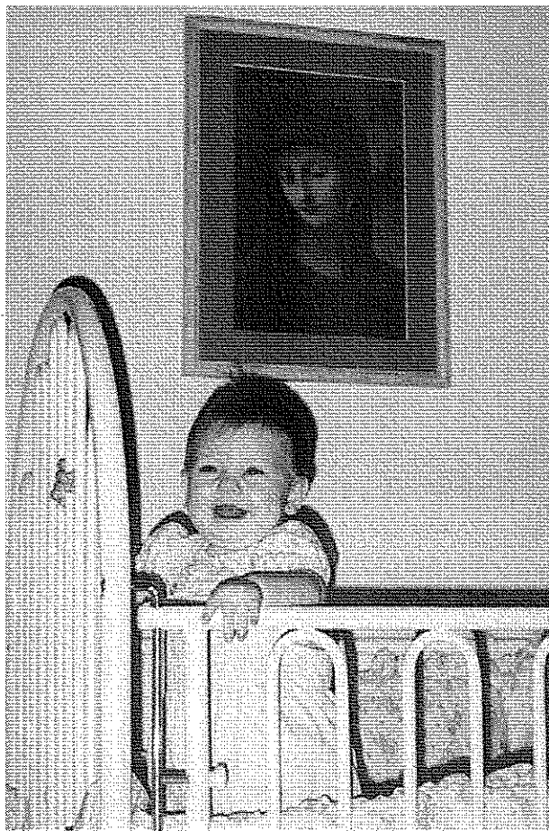
Mary is our Mother in the order of grace

"Mary watches over and protects the human race through her powerful intercession in Heaven."