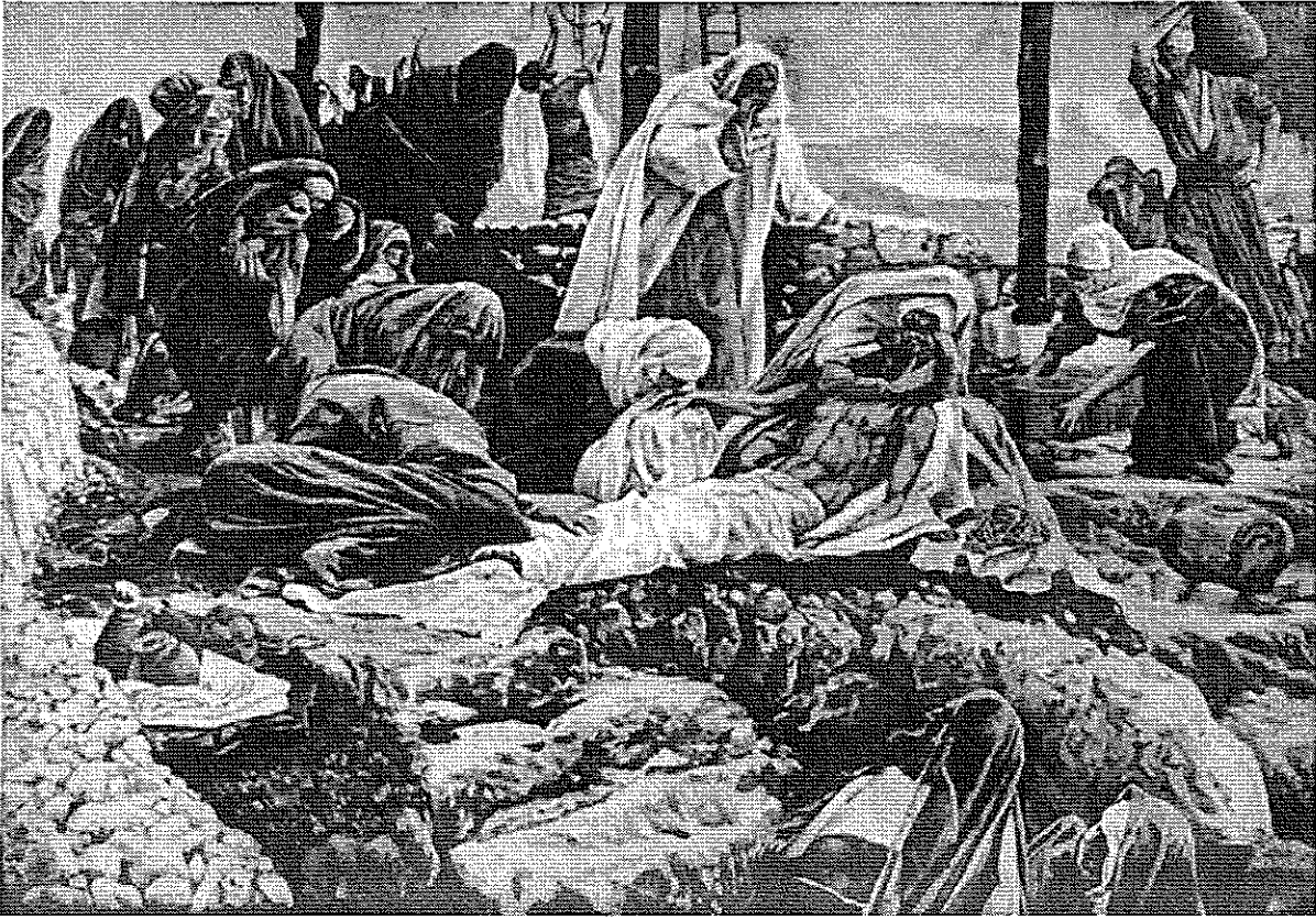
The Blessed Virgin receives the body of her Son, by James Tissot, 1836-1902

When God gives someone a high calling, he also gives the grace needed for it. There is no role that any human being has ever been called to that is higher than Mary's. She was called to be the Mother of Jesus Christ, who is God. The highest calling requires the highest grace. The doctrine of the Immaculate Conception does not in any way mean that Mary was not also redeemed by Christ. God is outside of all space and time, and therefore could easily redeem Mary in a unique way. The Church teaches, based on the teaching of Sacred Scripture and Sacred Tradition, that the merit and grace of Christ's redemption was applied by God to Mary at the very first moment of her conception in her mother's womb. In this way she was preserved from being born with original sin. She was given a sinless nature so that she could then give a sinless nature to her Son Jesus as a true human mother.