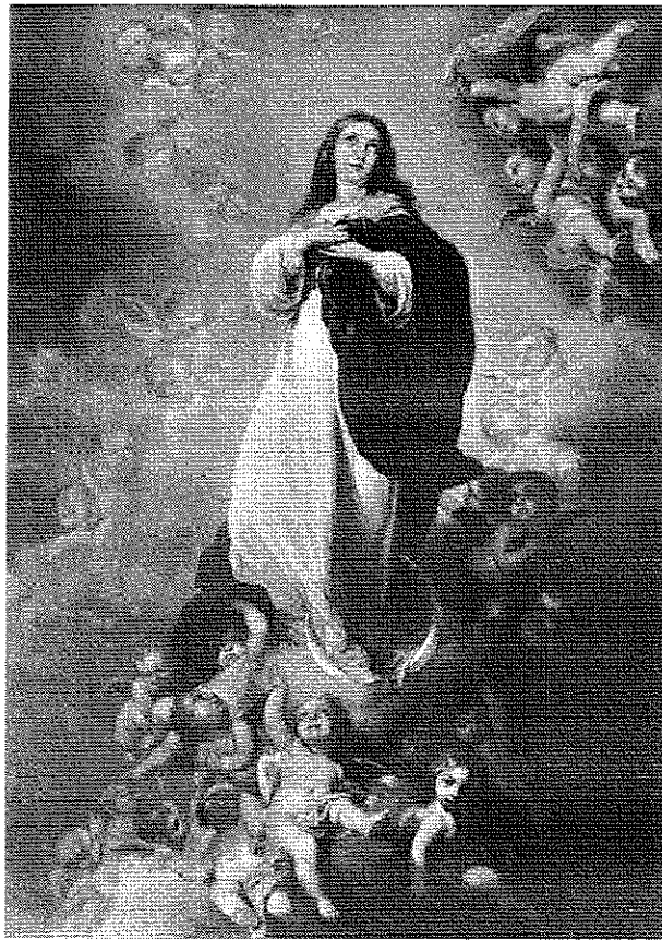
Immaculate Conception, by Bartolomé Murillo, 1617-1682

What basis is there for this doctrine in Scripture? Because of the sin of Adam and Eve, their friendship with God had been ruptured. And in them all humanity became subject to sin, Satan and death. Sacred Scripture reveals that almighty God is holiness