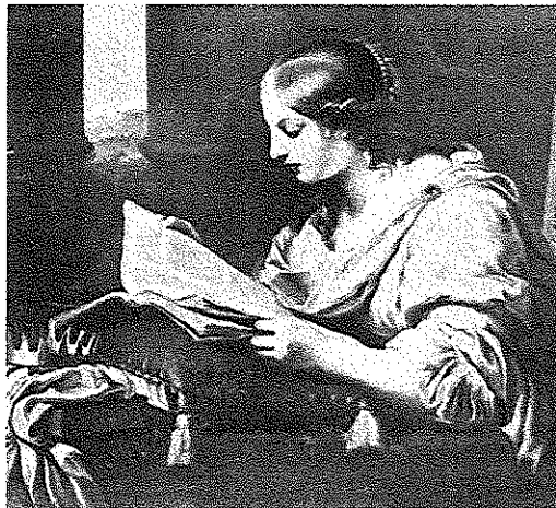
St. Catherine of Alexandria, by Carlo Dolci, 1616-1686